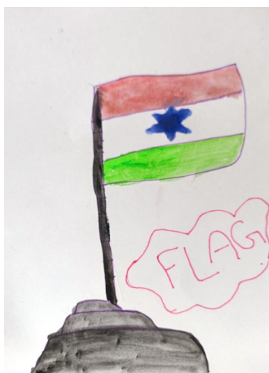
Art Work Done by Students of Primary Level