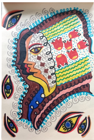
Art Work Done by Students of Elementary Level